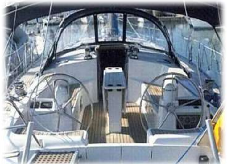
'ALPHA 51' layout - Skippeder yacht in Greece - Original pictures