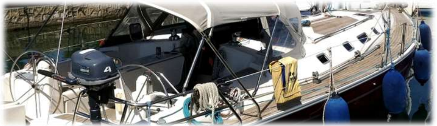
'ALPHA 51' layout - Skippeder yacht in Greece - Original pictures

Electronics: Radar + Autopilot + GPS-Chart plotter + EPIRB + VHF + Wind instruments + Sonar + CD player stereo.